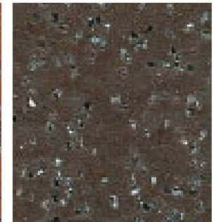
Walnut X4086 WR: 62 AM: 62