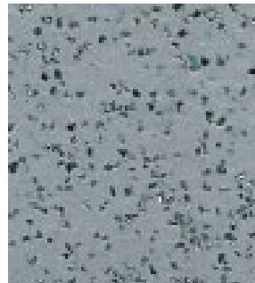
Pewter Grey X4039 WR: 81 AM: 81