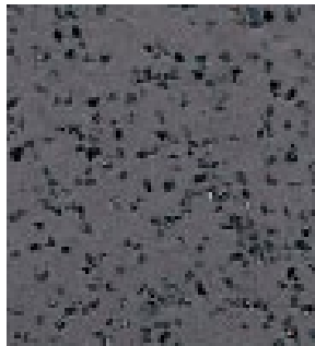
Anvil X4094 WR: 101 AM: 72