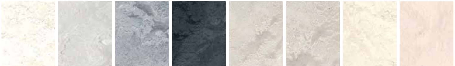
AD 501 AD 502 AD 503 AD 504 AD 505 AD 506 AD 507 AD 509