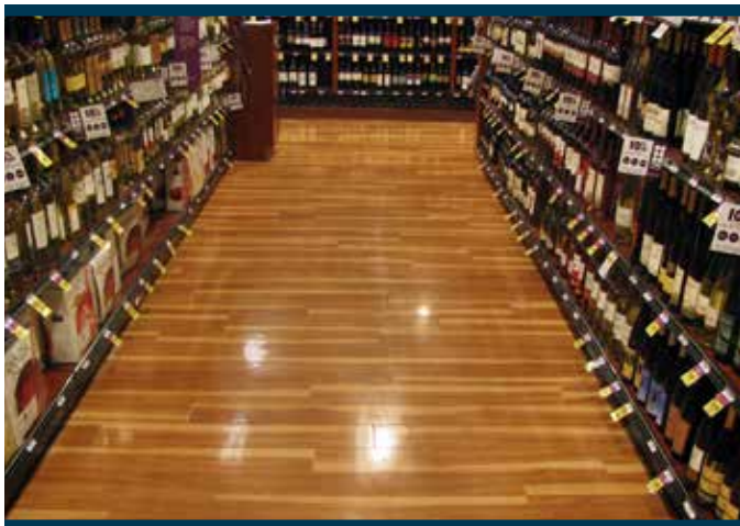
7871E Cedar Plank