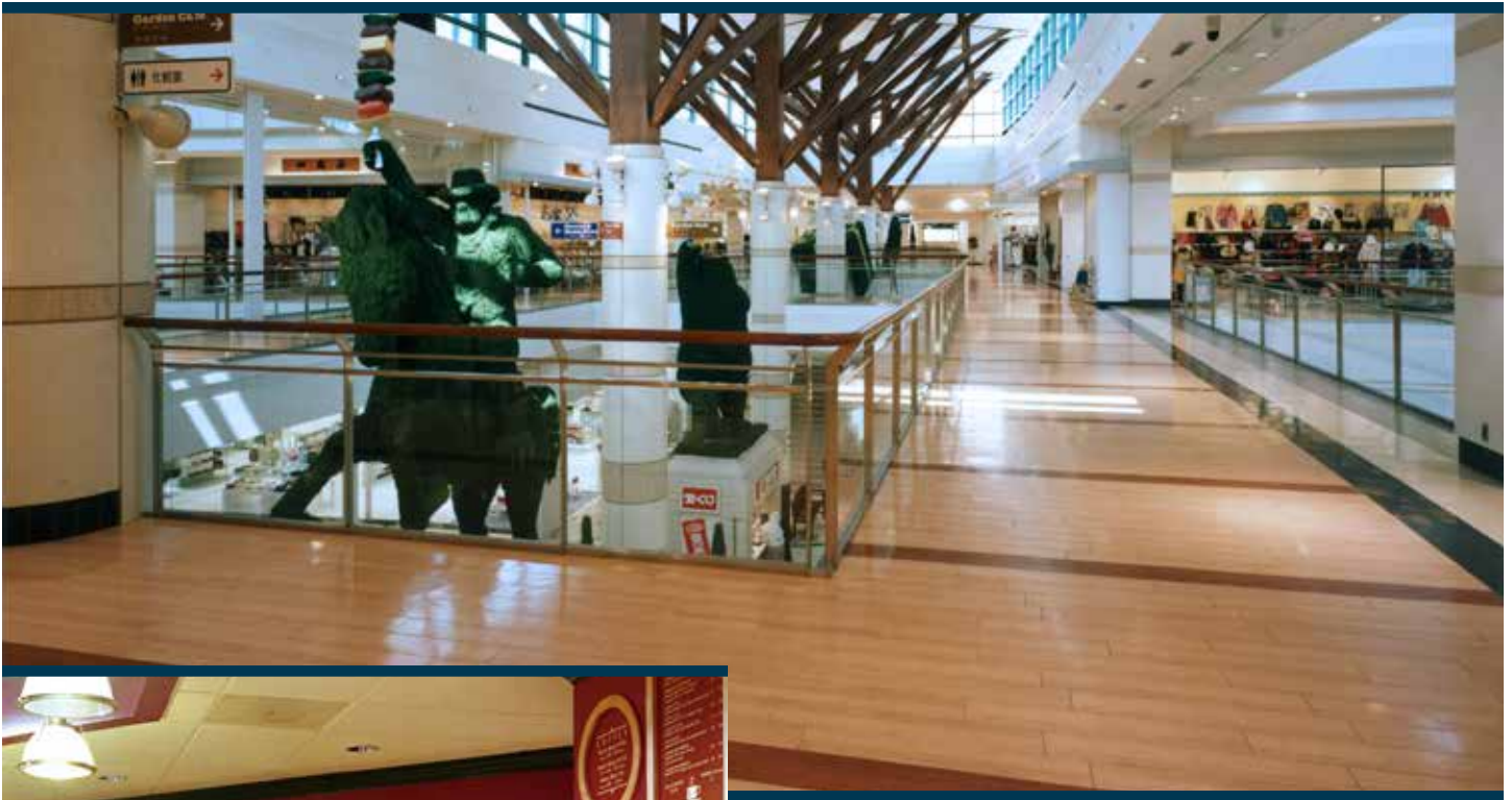
7262E Natural Maple