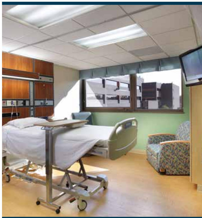
7850E Classic Maple

The highest quality films are used to give Lightwood the finely detailed wood grain appearance of natural oak, maple, cherry, cedar and other attractive wood species. It's available in 26 rich shades, in 4" and 6" planks. But that's where the similarity to real wood ends and the advantages of Lightwood begin. An extended construction process ensures Lightwood is dimensionally stable, which allows for a safe and secure installation. It also provides a higher PSI and greater resistance to indentations for long life. Lightwood has outstanding acoustical properties, too. And, while it can be waxed where a high gloss is preferred, Lightwood's low luster wear surface stands up to heat, cold, spills and heavy foot traffic with or without wax.