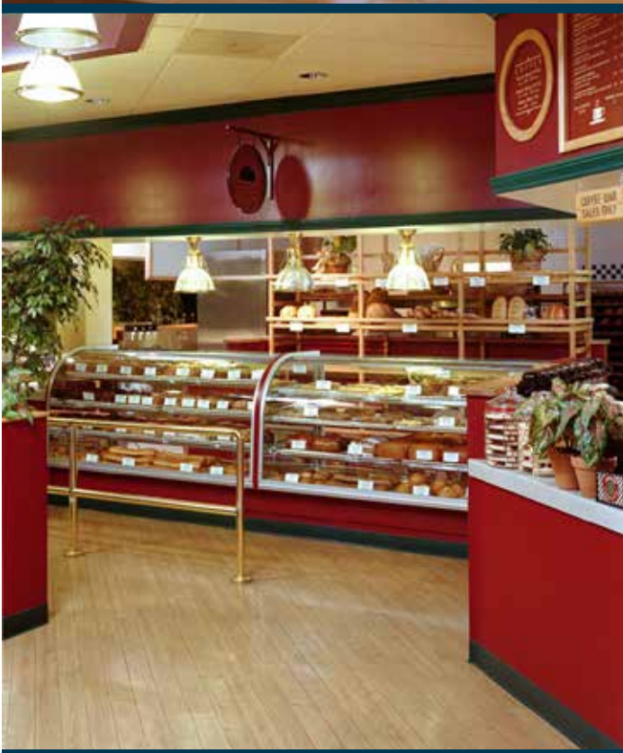
1022 Golden Oak